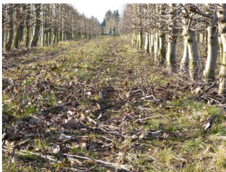
a) pruned biomass in Orchard 1