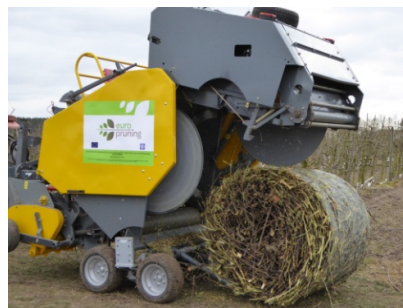
b) PRB 1.75 in operation