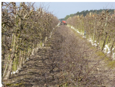
a) pruned biomass in Orchard 1