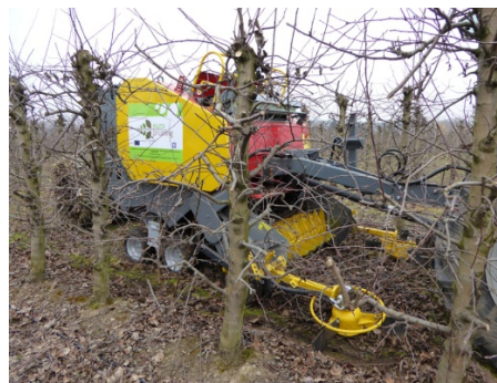
b) PRB 1.75 in operation