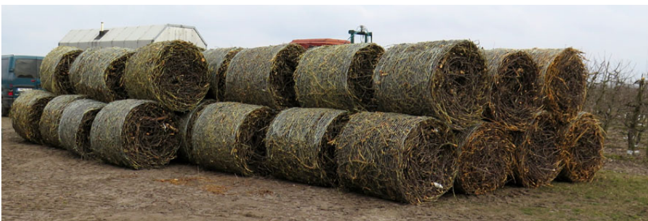
Fig. 3. Bales of apple pruning wood collected from Orchard 2