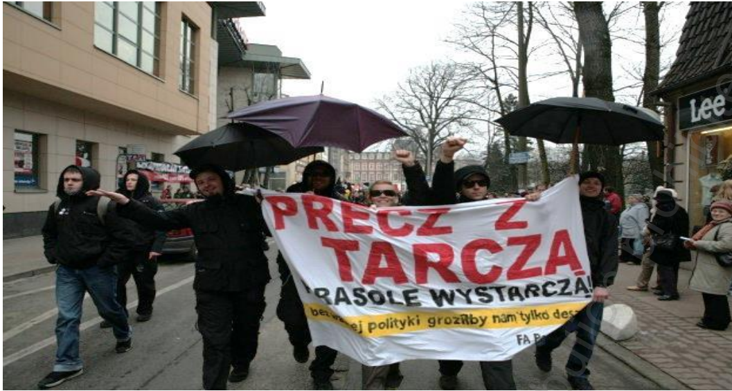
Fig. 3. The inhabitants of the Słupsk region against the creation of the shield