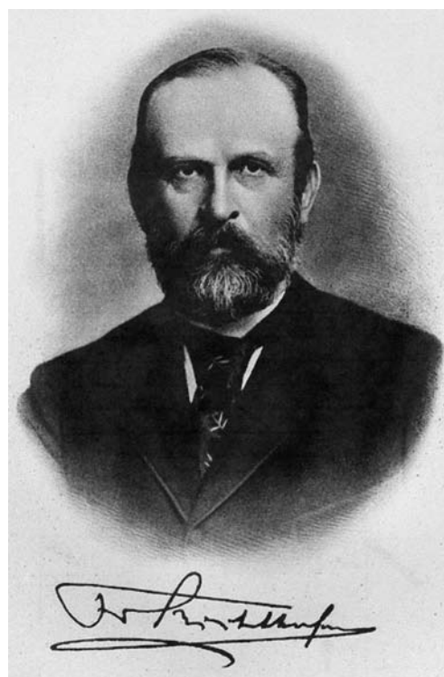
Fig. 4. F. von Richthofen.

"Berg elaborated the study of landscapes and developed the teaching of V.V. Dokuchaev, on natural zones in his works 'Landscape and Geographical Zones of the USSR' (part 1, 1931; 3 rd ed., 1947; part 2, Geographical Zones of the Soviet Union,