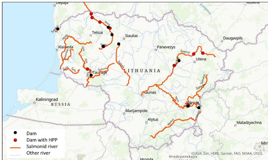
Fig. 1. Locations of dams on salmonid rivers in Lithuania

There are 13 salmonid rivers in Lithuania (Order of Minister of Environment, 2002), and the number of dams on these rivers is 19, of which 10 have small hydropower plants (HPP). The location of salmonid rivers and dams is presented in Fig. 1.