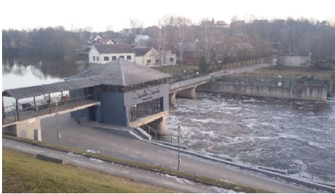
Fig. 5. The view of the Anykščiai dam

Lastly, looking at the Rokantiškiai dam example, why the dam with HPP can be recommended for removal may be analysed. Rokantiškiai dam was built in 1934. The reconstruction into HPP (installed capacity of 132 kW) was made in 2004 (Fig. 6).