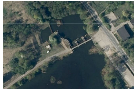
Fig. 6. The Satellite view of the Rokantiškiai dam site

The Rokantiškiai dam has a fish pass and a relatively low potential for salmonid fishes (4,606.5 Eur/y). Still, it is an old dam in a bad state. It is the fourth worst dam according to electricity generation (371.6 MWh) of all dams on salmonid rivers in Lithuania with HPP. Furthermore, it is a dam in the protected area with no need for a bridge. The removal will free the 48.5 km of the river Vilnia, which would cost approximately 309,647 Eur. Can that justify the removal; it remains to be seen.