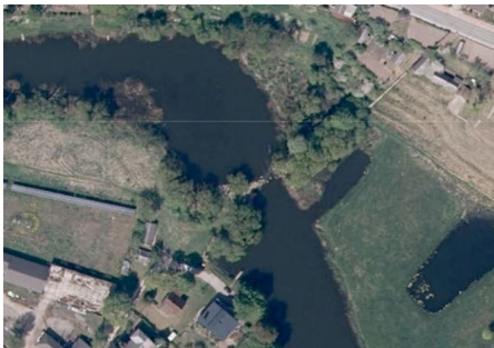
Fig. 3. Satellite view of the Kuršėnai dam

According to the MCDA tool, the second dam for removal is Augustaitis' mill dam. It is the site of an old watermill, built in 1932 (Fig. 4). The main reasons for these recommendations are that this dam is in a critical state, has no fishpass and is in a protected area. Other strengths are that it does not have HPP, there is no need for a bridge, the downstream stretch has a natural riverbed, and the removal would not be expensive (30,658 Eur.).