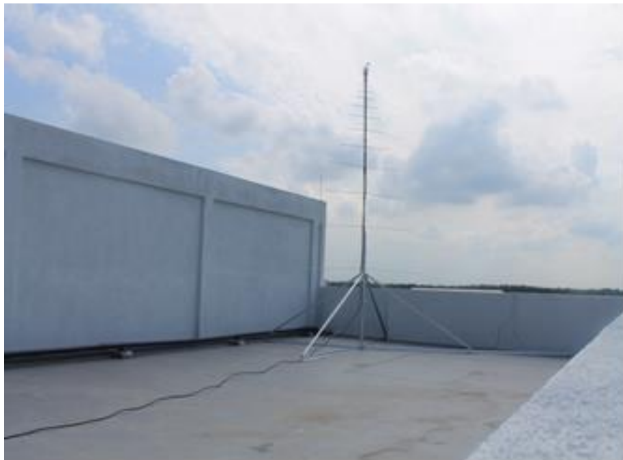
Figure 2. The Log Periodic Dipole Antenna (LPDA) at National Space Centre Banting Selangor.