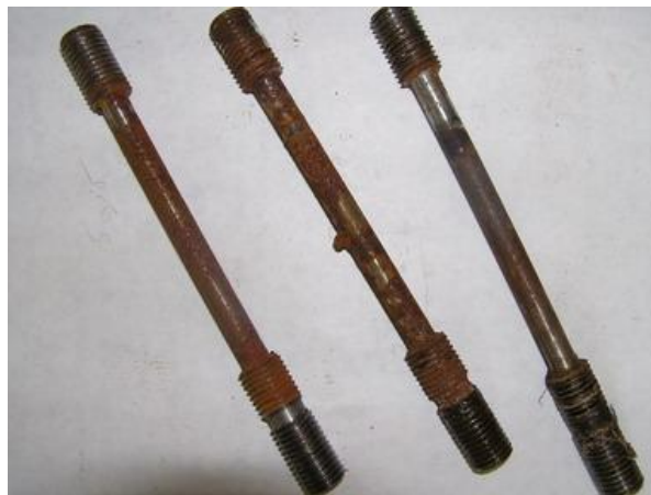
Fig. 5. Tested specimens for corrosion cracking with a welded rod

A change in the value of relative reduction were observed in all specimens with corrosion damage with a decrease in 1.14-1.22 times. In this case, an increase in the aging time of specimens in a corrosive environment leads to a more significant change in the characteristics of plasticity. Consequently, the characteristics of plasticity are more sensitive to corrosion of the surface than the strength characteristics.