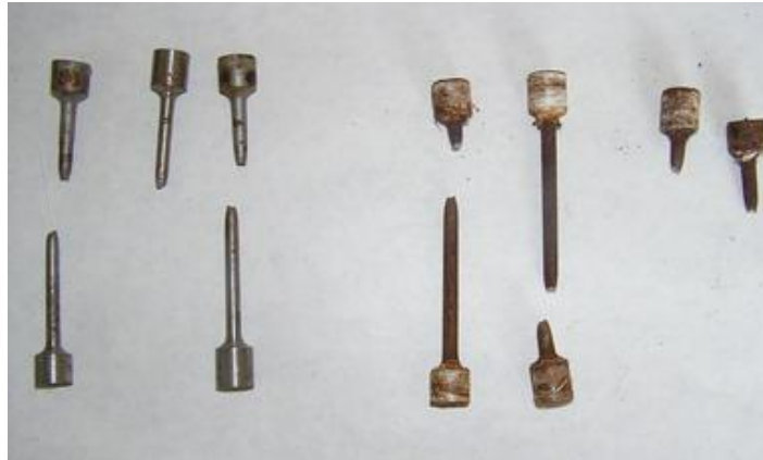
Fig. 4. Tested specimens by static loading in the air environment