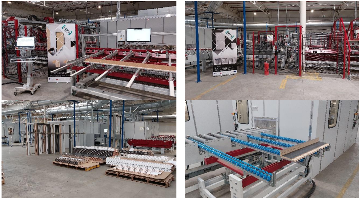
Figure 1. Technological line PortaFRAME