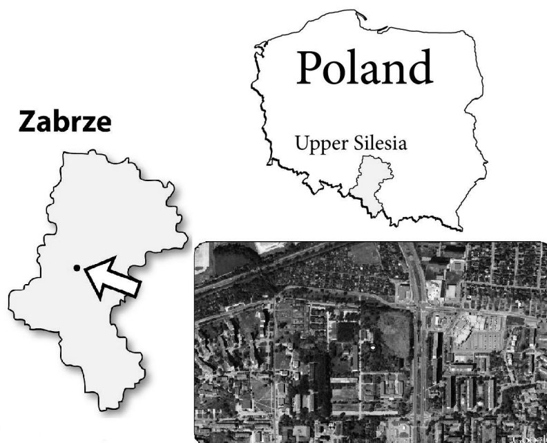
Fig. 1. Location of sampling site

The site, selected in Zabrze for the experiment, is representative of the typical air-pollution conditions in the central part of Upper Silesia – by the Directive 2008/50/EC definition [7], it is an urban background measuring point (Fig. 1). The effects of the industrial and municipal emissions on living quarters of the agglomeration are represented and may be observed very well there.