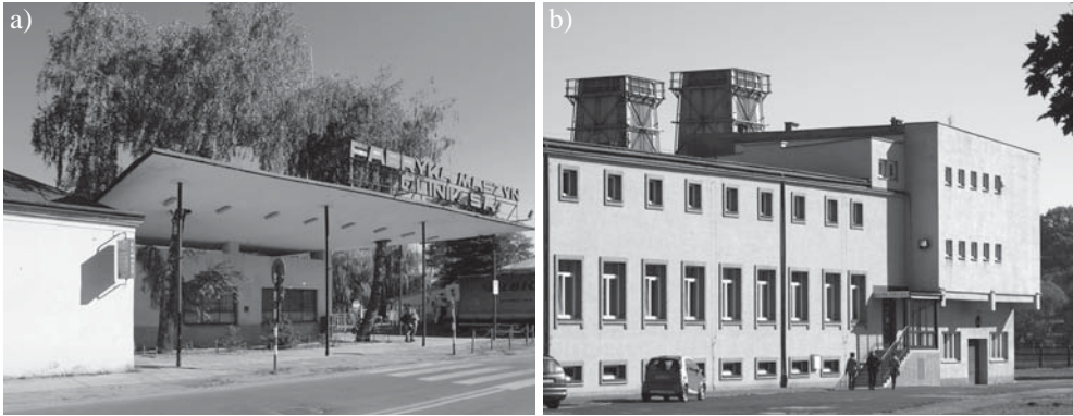
Fig. 3. Gorlice. GLINIK drilling tool factory. a) The roofing of the main porter's lodge is of the 1960s; the birch trees are in accord with the architecture, b) The hall of mechanical department with an office wing; cooling towers in the background, 1960s.

Those two companies were founded in 1883 by the Canadian entrepreneur W.H. MacGarvey. The plant buildings are appended by housing complexes for the plant's employees (the primary complex and the so called New Settlement complex built in the 1950s), "Casino", two-family villas for the supervising personnel, and a primitive home of the founder who lived there between 1895 and 1914. The plant founded a school in the town and arranged the municipal park.