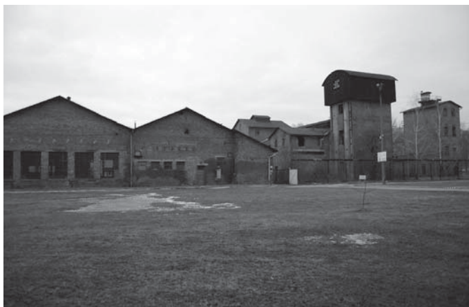
Fig. 1. Limanowa, the former Sowliny oil refinery, 1904–1909. General view from the East with the water tower and the company’s fire station.

The plant consists of technological buildings (production halls, storehouses, casing structures), service buildings (fire station, water tower) (Fig. 1), social services (“Casino”, park), housing for the workers and the supervision personnel, villas for the director and the chief technologist. The urban composition testifies to the original planner’s attention to aesthetics, spatial legibility, and detail [14].