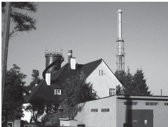
Fig. 2. Gorlice, GLIMAR oil refinery. The two-family villa for higher rank staff members, S. Wyszynskiego Str. 15, 1920s, as seen from the South, the paraffin preparation tower, the red brick smokestack of the central boiler house, and the metal sheet chimney.